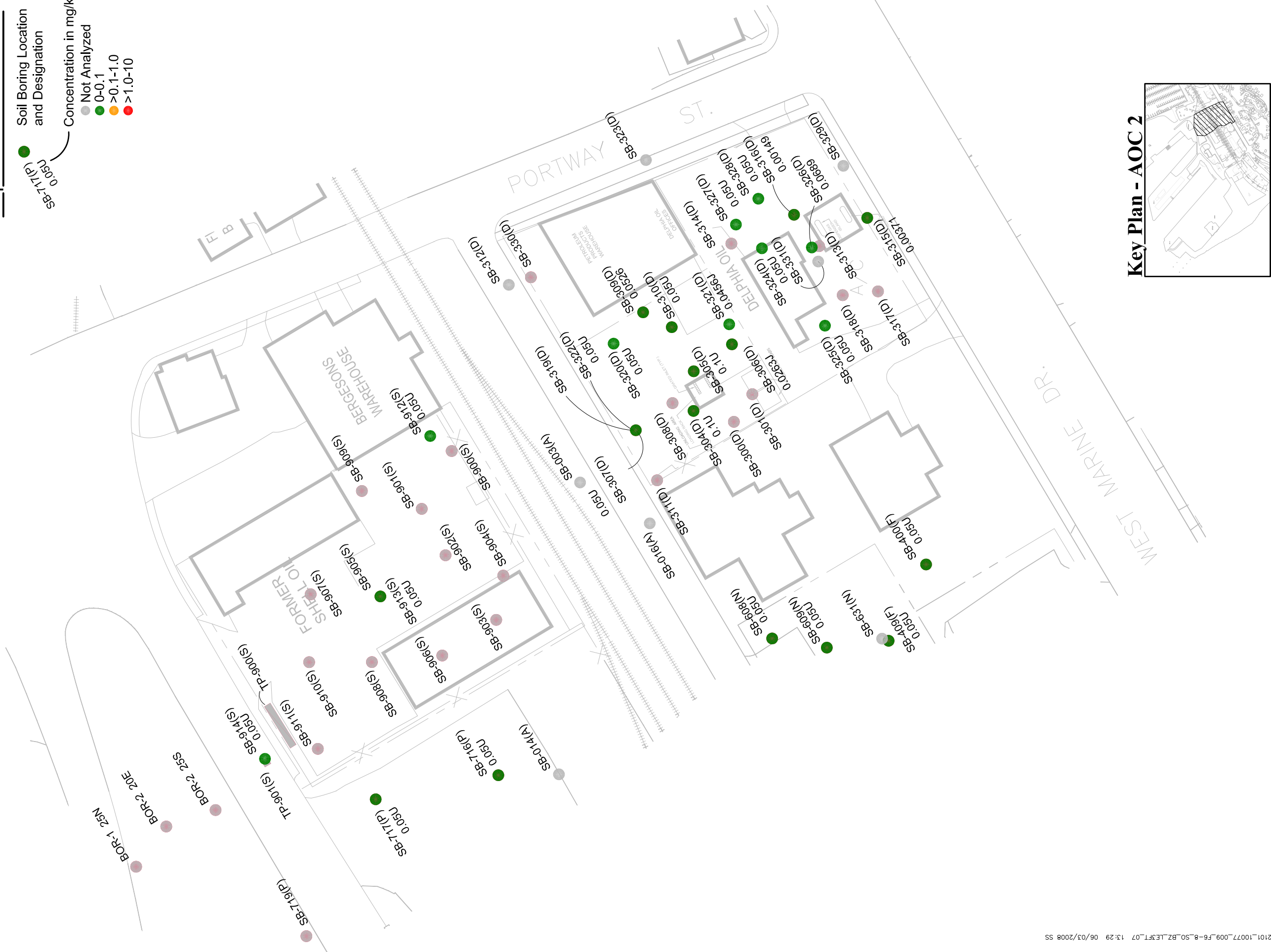
Key Plan - AOC 2